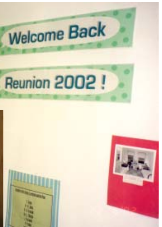
Friday evening registration and wine and cheese social - at Sheptytsky Institute