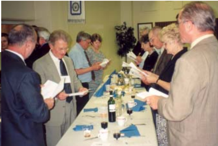
Singing for their supper!