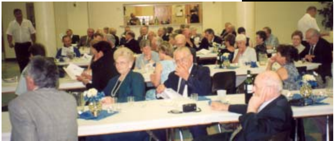
Plast Ukrainian Scout Organization with power point presentation and sing-song.