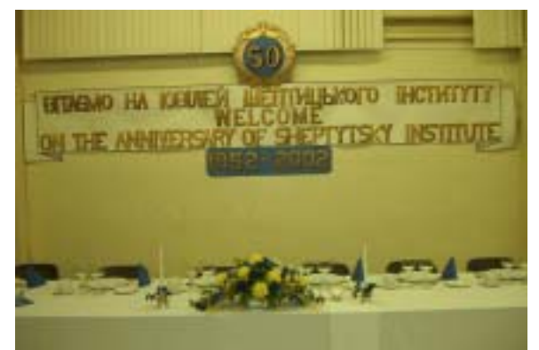
The head table awaits banquet guests!