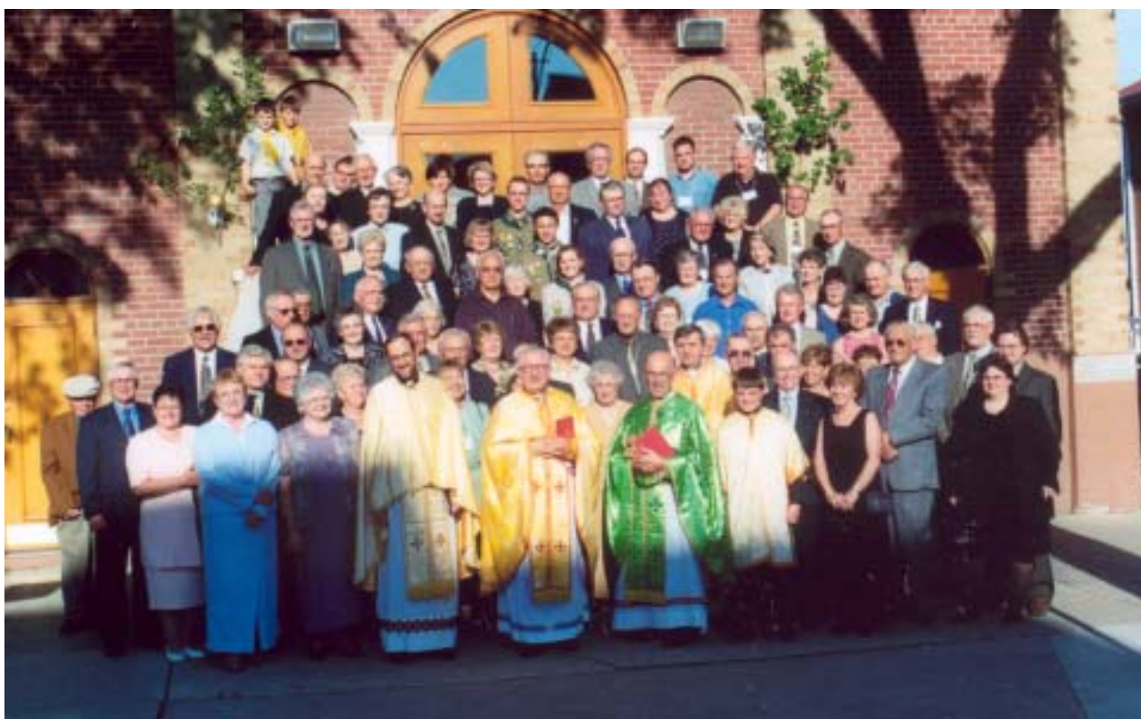
Participants of Divine Liturgy at St. George's Cathedral - Saturday