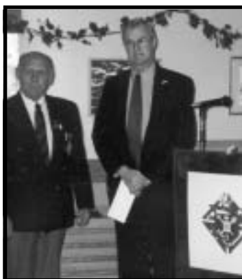
Knights of Columbus Inc. and the Saskatoon Chapter presentation of $4,000 to Sheptytsky Institute.